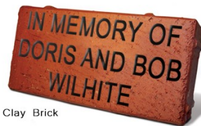
4"x8" Clay Brick