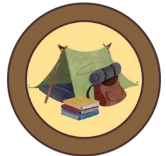
Sample Schedule for Carthage Public Library

May 26th, 1:00pm Paper airplane contest at the library. 2:00 pm Tie Dying at Friendship Park